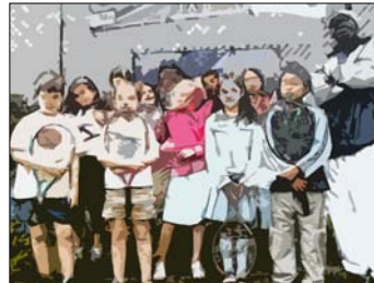
Children at the Summer Holiday Tennis Camp 2005 MATCHPLAY

The Club has been working towards City Tennis Club status. The CTC initiative is run by the Lawn Tennis Association to promote tennis in inner city areas. Currently some 27 clubs have been approved. To achieve this status we have submitted a three year plan about how we see the Club developing with particular focus on increasing the numbers of juniors playing and their access to tennis coaching at an affordable rate. As well as bringing in