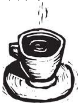
Burgess Park Tennis Café

Burgess Park Tanner Street GMH Park Lilian Baylis Bradfield P'ham Central Salmon Centre