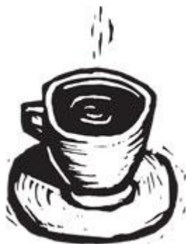
Burgess Park Tennis Café