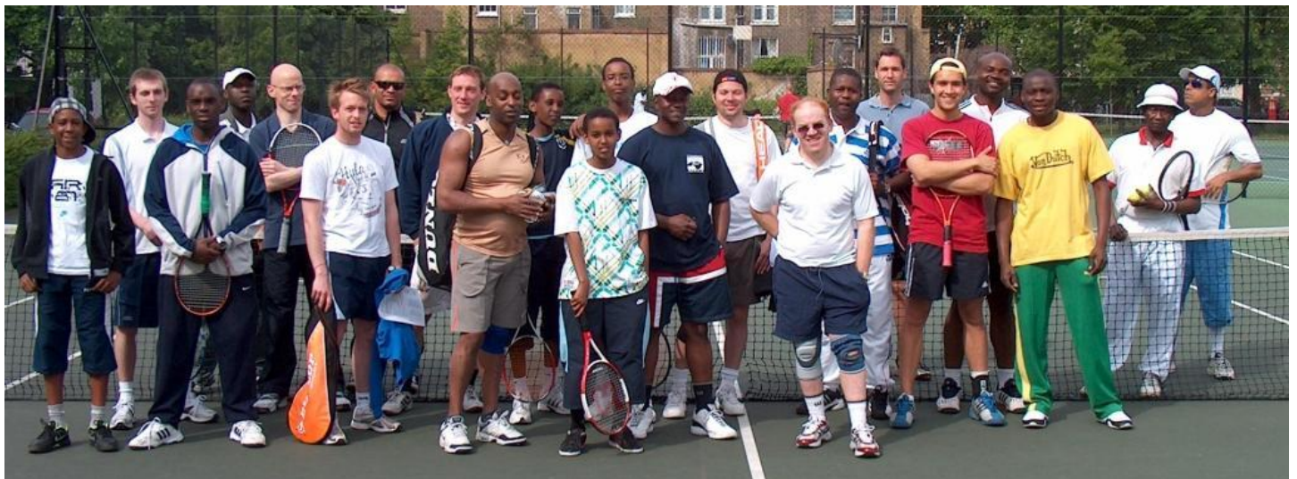
The men's doubles event.

In the Surrey winter leagues the men's team are playing in Division S and the women's team in Division R. We have a men's and a women's team in the Southwark leagues.